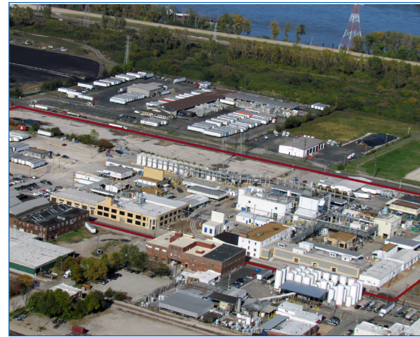
ELANTAS PDG, Inc. headquarters in St. Louis, Missouri

ELANTAS Electrical Insulation companies are strategically located throughout the world to meet the primary insulation, secondary insulation and electronic and engineering materials needs of our customers.