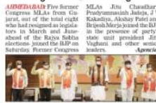
Former Congress MLAs show victory sign after joining BJP in the presence of BJP State President the flagman, at their headquarters in Gandhinagar on Saturday.